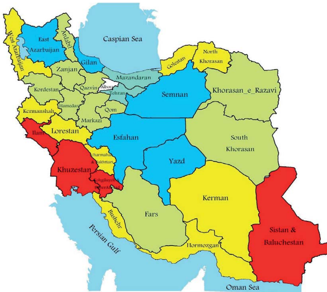
For data see Tables 13.1 and 3.2